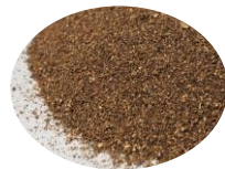
Insect frass Fertilizer