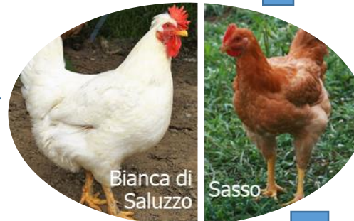
Bianca di Saluzzo

Live BSF larvae Fed with organic residues